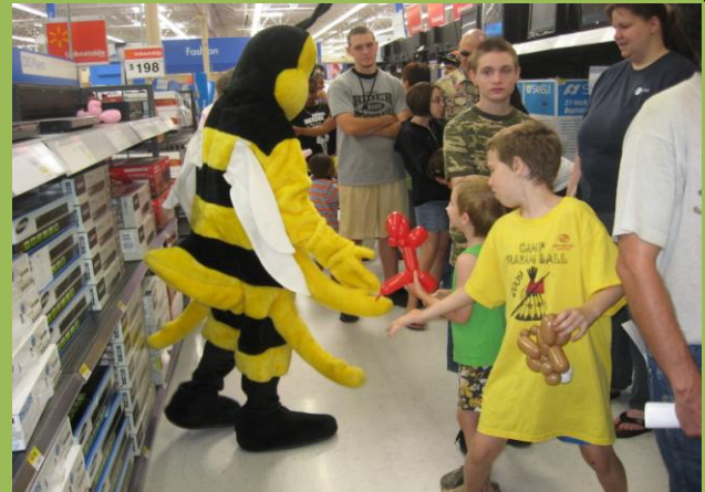
Bee and children had fun during immunization day.