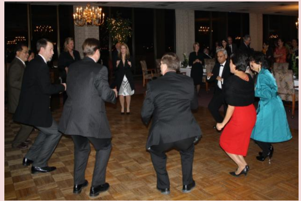
They look GREAT! dancing the "Chicken Dance"