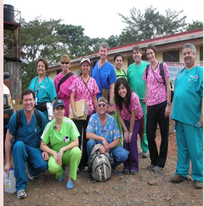
Nicaraguan's Mission - Great Job!

Check our website at: www.wcmatx.org to see the pictures.